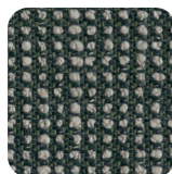
timo arredo Sunbrella® 36180.01.218

** Il tessuto rigenerato Sunbrella può presentare filamenti di diverso colore, una naturale specifica del materiale riciclato. - Sunbrella regenerated fabric may feature threads in different colours, a naturally occurring characteristic of recycled material. - Le tissu régénéré Sunbrella peut présenter des filaments de différentes couleurs, une caractéristique naturelle et spécifique du matériau recyclé. - Das regenerierte Gewebe Sunbrella kann Fasern anderer Farbe aufweisen, eine natürliche und spezifische Eigenschaft des recycelten Materials. - La tela reciclada Sunbrella puede presentar filamentos de otro color diferente, una característica natural y específica del material reciclado.