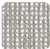
perla arredo Sunbrella® 36180.01.214