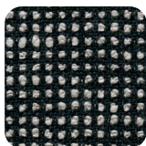
lava arredo Sunbrella® 36180.01.216