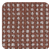
cannella arredo Sunbrella® 36180.01.220